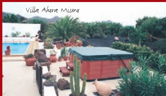
Villa Ahora Mismo

Outside, next to the private L-shaped pool, there is a secluded terrace with sunbeds and a barbecue. This property is suitable for naturist use.