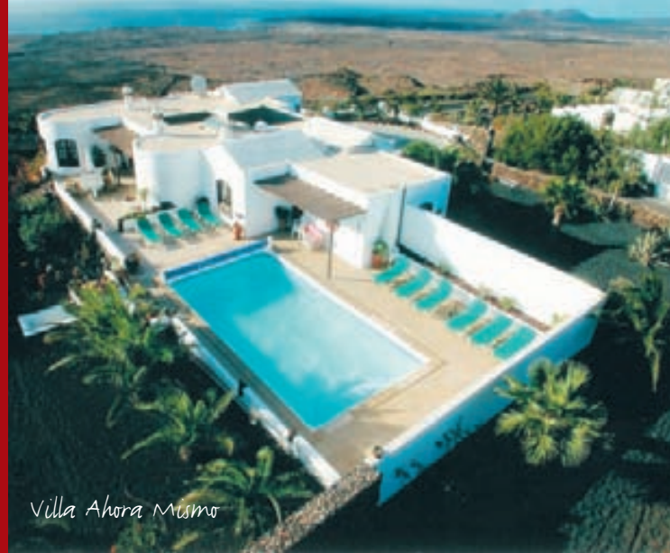
Villa Ahora Mismo

Bedrooms: 5 Bathrooms: 4 Swimming Pool: Pool Size: 10 x 5 m New Jac